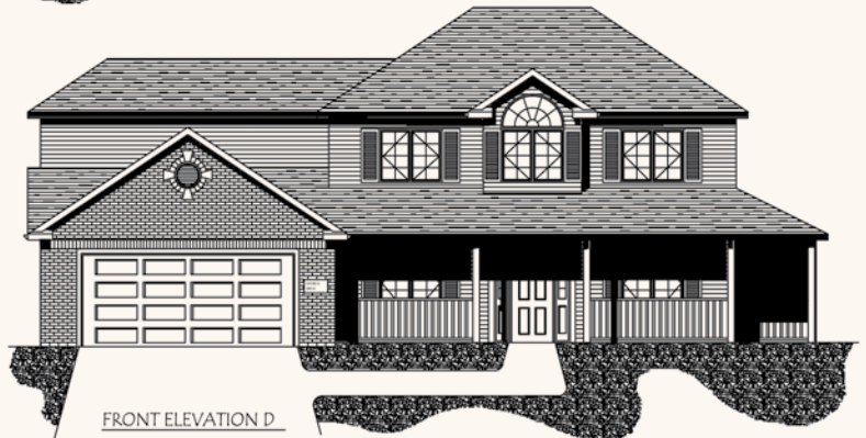
FRONT ELEVATION D