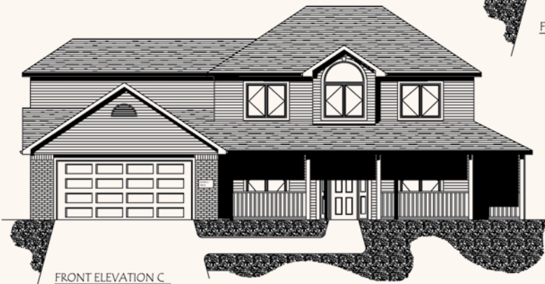
FRONT ELEVATION C