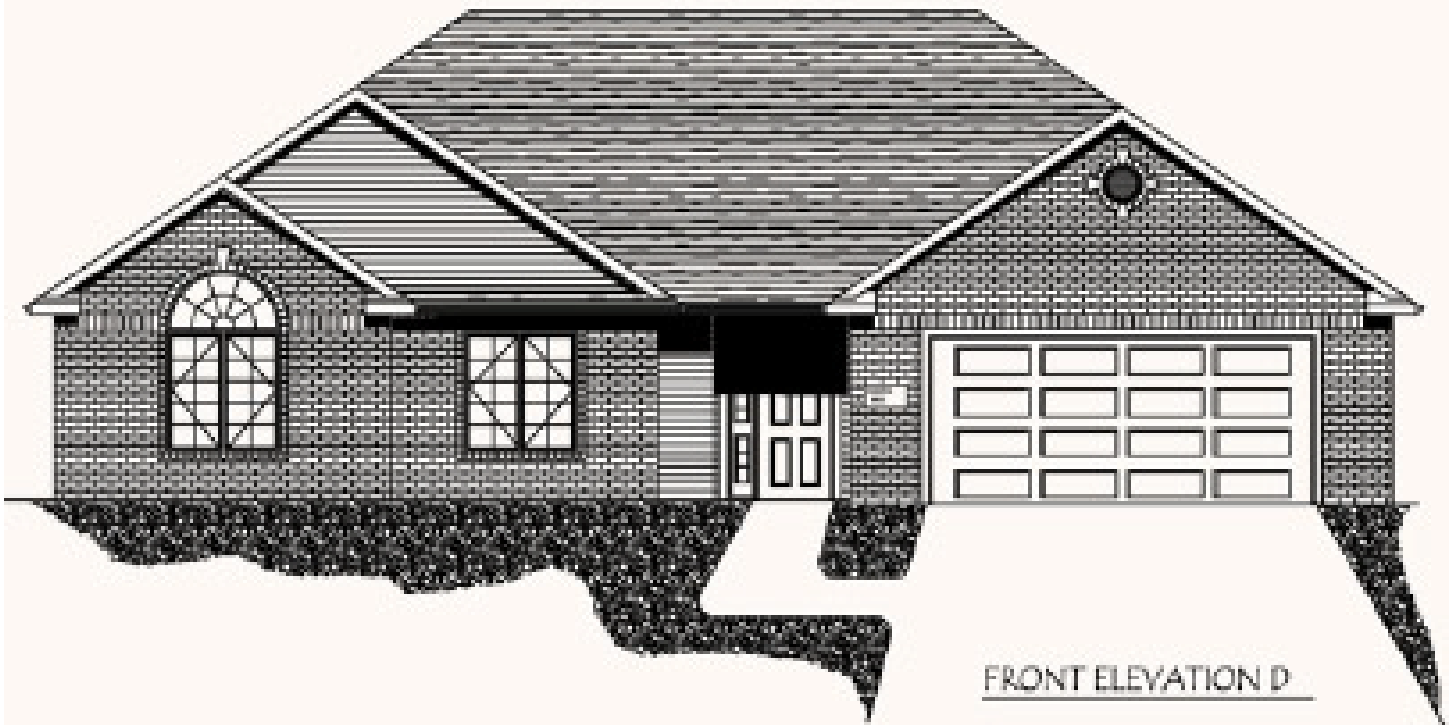
FRONT ELEVATION D

RENDERINGS AND FLOOR PLANS ARE ARTIST'S CONCEPTION OF TYPICAL HOMES AND DO NOT NECESSARILY REPRESENT FINAL PLANS, DIMENSIONS, DESIGNS OR ELEVATIONS. PRICES, PLANS AND SPECIFICATIONS ARE SUBJECT TO CHANGE WITHOUT NOTICE.