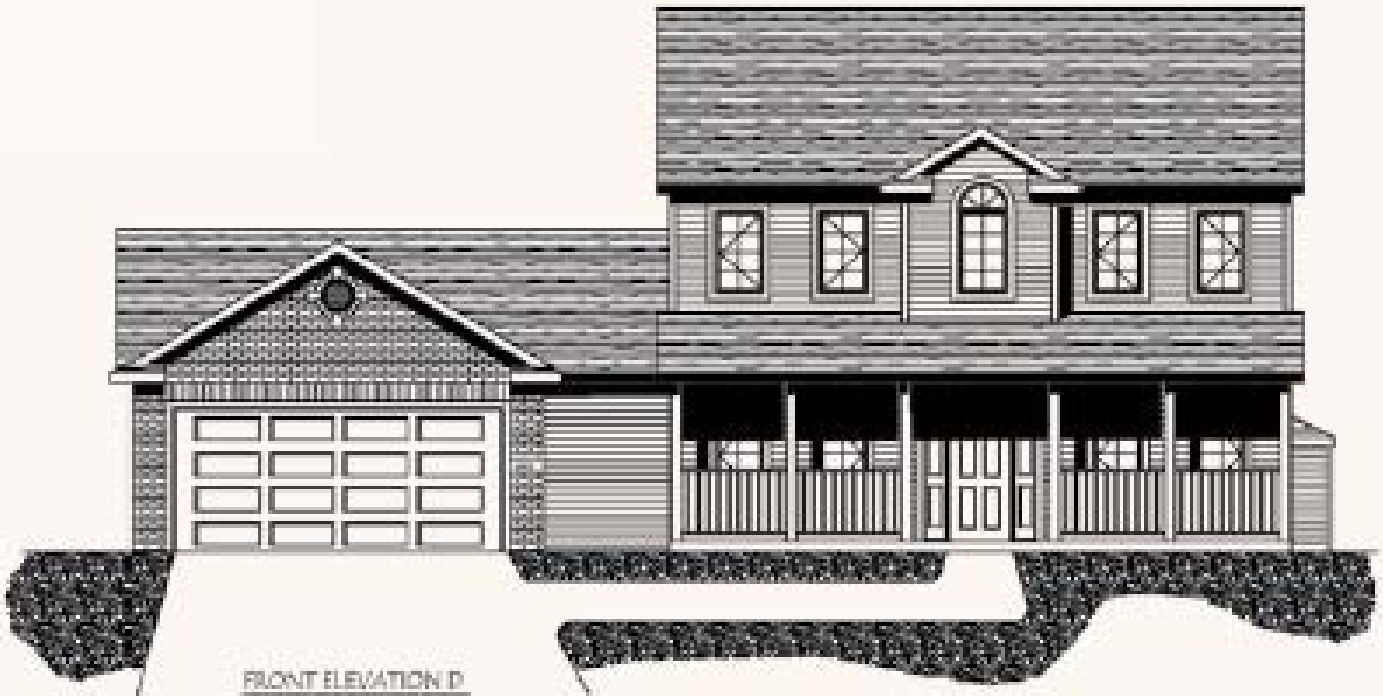
FRONT ELEVATION D

RENDERINGS AND FLOOR PLANS ARE ARTIST'S CONCEPTION OF TYPICAL HOMES AND DO NOT NECESSARILY REPRESENT FINAL PLANS, DIMENSIONS, DESIGNS OR ELEVATIONS. PRICES, PLANS AND SPECIFICATIONS ARE SUBJECT TO CHANGE WITHOUT NOTICE.